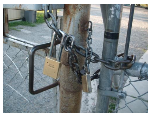
The Wrong Way To Lock The Gate